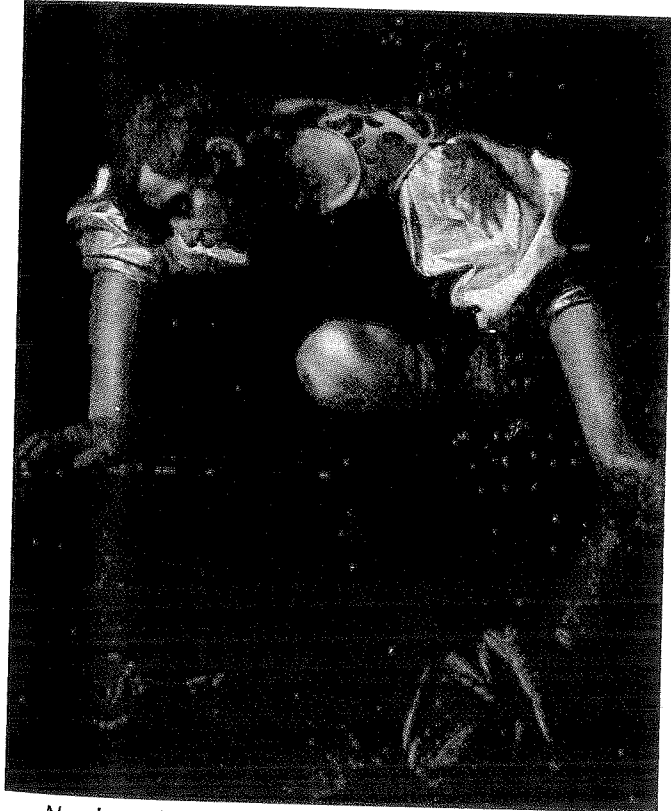
Narcissus , 1600. Michelangelo Merisi da Caravaggio. Galleria Nazionale d'Arte Antica, Rome.